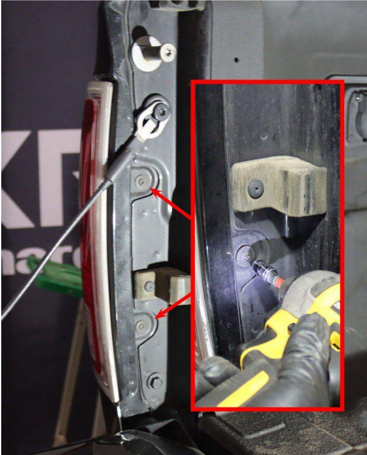
After screws removal, gently pull the tail light outward with a slight angle.